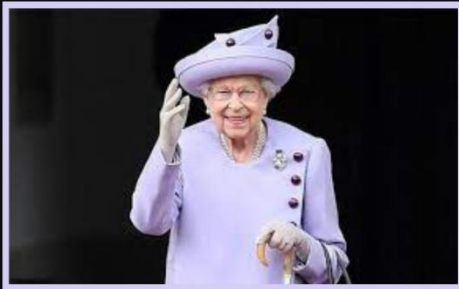
Queen Elizabeth II 1926 - 2022